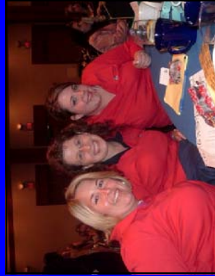
Sisters raise funds for programs that help advance womanhood through personal growth, intellectual development and selfless giving.